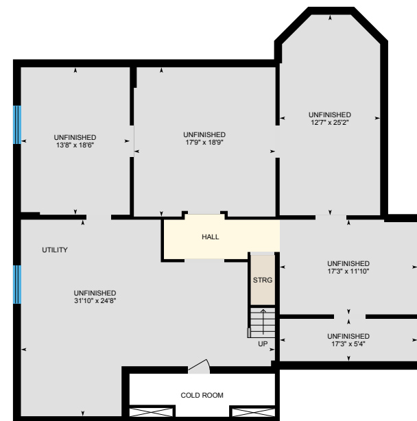
Basement (Below Grade) Exterior Area 2131.38 sq ft