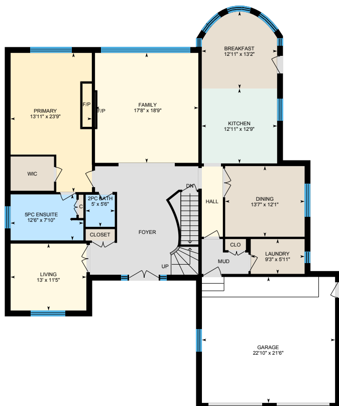
Main Floor Exterior Area 2158.30 sq ft

Main Building: Total Exterior Area Above Grade 3092.62 sq ft